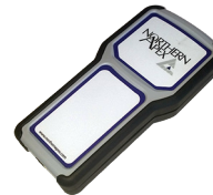
RG 900 USB Handheld Reader