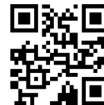
2D Data Matrix Tag