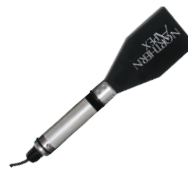
RG Radiant Wand