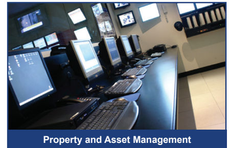
Property and Asset Management