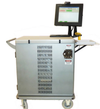
Mobile RFID Station