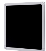
10" Flat Antenna