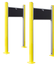
Dock Door Antennas