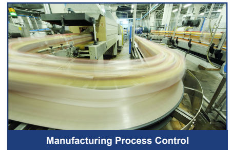
Manufacturing Process Control