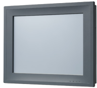
Industrial Touch Panel

Our suite of hardware has been carefully designed to work together to provide optimum performance. A typical system utilizes a visibility station as a central hub and antennas (hand-held and stationary) which are positioned at strategic points in your process to capture all relevant data.