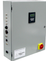
Quality Control Station Hub