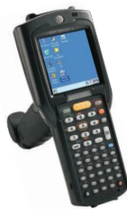
Handheld RFID Reader