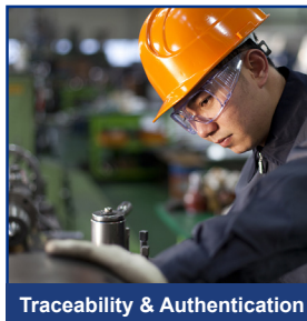
Traceability & Authentication