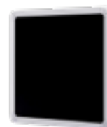
10" Flat Antenna