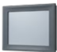
Industrial Touch Panel

Our suite of hardware has been carefully designed to work together to provide optimum performance. A typical system utilizes a visibility station as a central hub and antennas (hand-held and stationary) which are positioned at strategic points in your process to capture all relevant data.