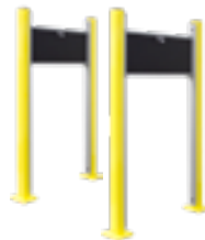
Dock Door Antennas