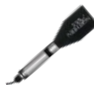
RG Radiant Wand