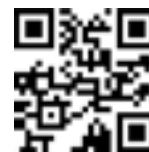
2D Data Matrix Tag